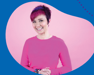
The late Cal Wilson was the 2023 Gala Dinner Event Host.

We were privileged to have the late Cal Wilson as MC for our Gala Dinner. She lit up the room and was a joy to work with. Our condolences to her family and friends.