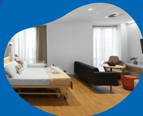
One of the stunning maternity suites that will feature in the new Private Hospital Tower.