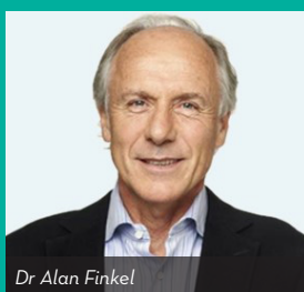
Dr Alan Finkel