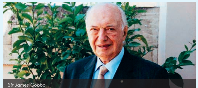
Sir James Gobbo

"Sir James was a great man. He was highly respected for