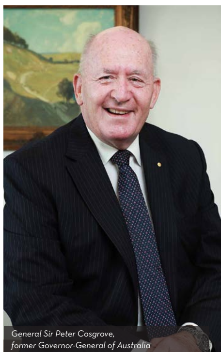
General Sir Peter Cosgrove, former Governor-General of Australia