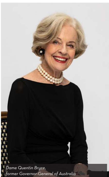
Dame Quentin Bryce, former Governor-General of Australia