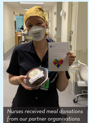
Nurses received meal donations from our partner organisations