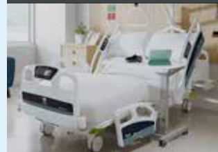
A Cuddle Bed is custom designed to enable loved ones to be close to patients, often during the final stages of their life.