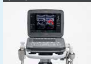
Ultrasound Machines are used in complicated, life-saving procedures that are performed every day at St Vincent's.