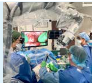
An Exoscope is cutting-edge technology that helps treat patients who need complex neurosurgery.

All donations over $2 are tax deductible