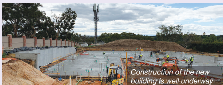
Construction of the new building is well underway

Construction of the new St Vincent's Caritas Christi building commenced in March 2020. We're excited to report that the first concrete pour happened just before Easter.