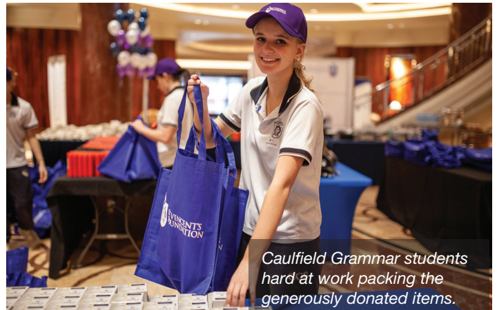
Caulfield Grammar students hard at work packing the generously donated items.

The packs are being distributed to patients who are in need of these essential items.